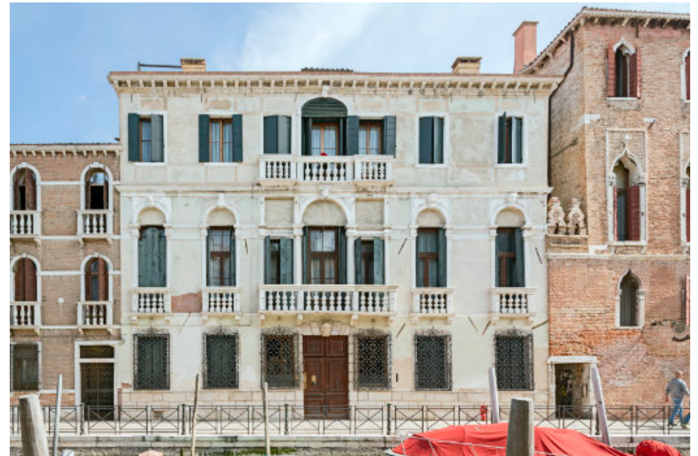
Palazzo Minotto: https://palazzominotto.com/