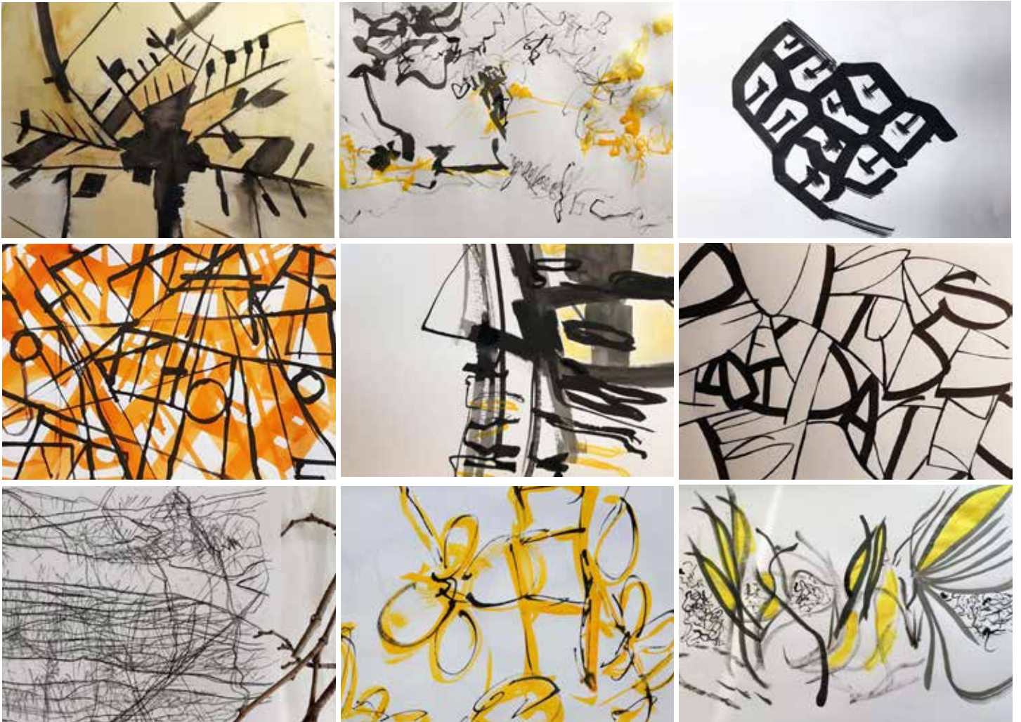
All the images are student's works from Monica's workshops 'A Bridge Between Drawing and Writing'.