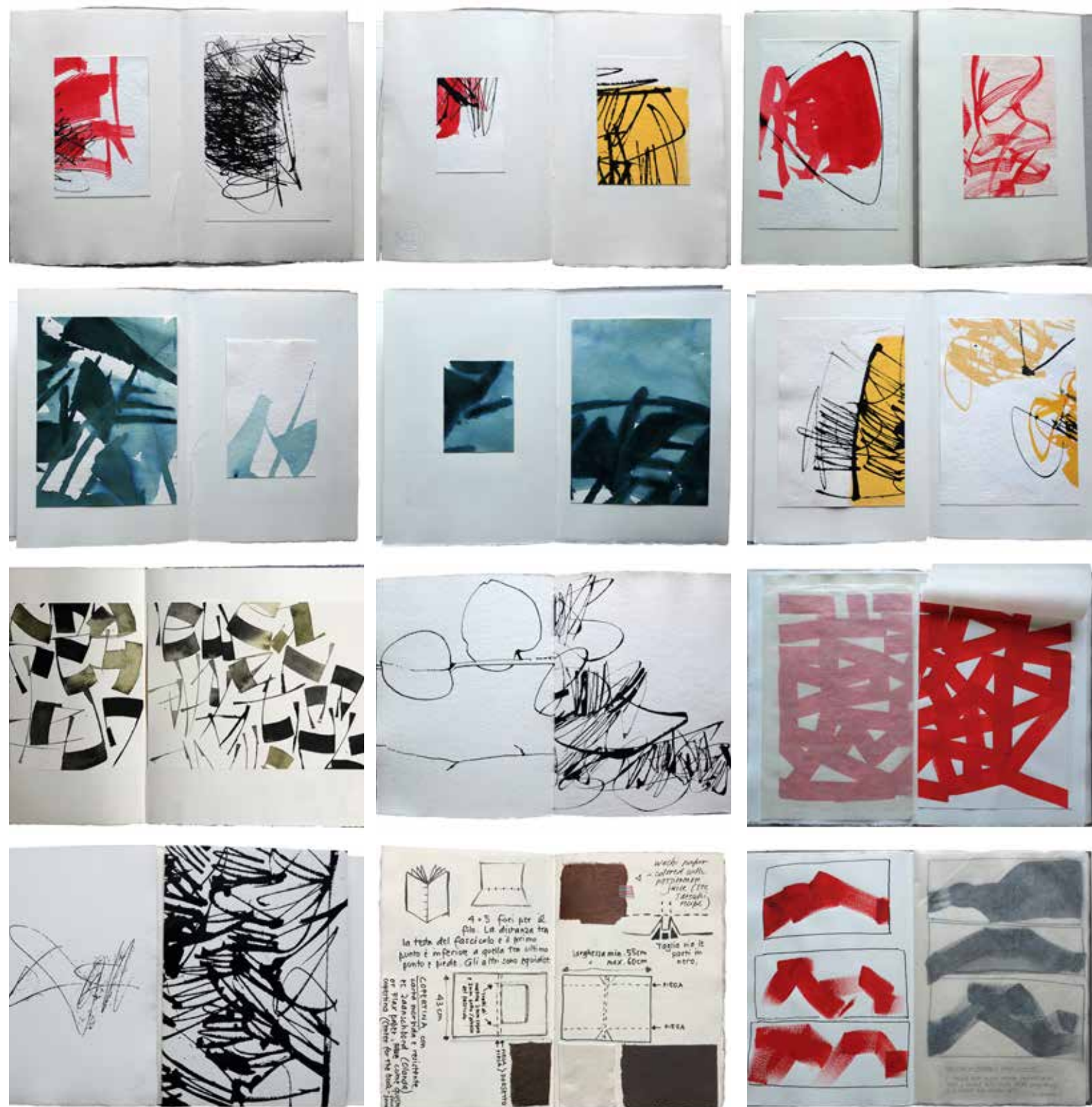
All the images in this page are Monica Dengo's sketchbooks

with Monica Dengo ONLINE - January 30/31, 2021